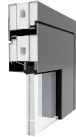
Door & Frame